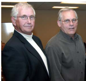
The ARTA President and the CRTA President